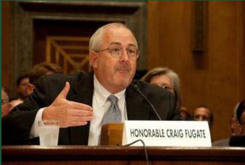
Craig Fugate FEMA Administrator

“My experience tells me if we wait and plan for people with disabilities after we write the basic plan, we fail.”